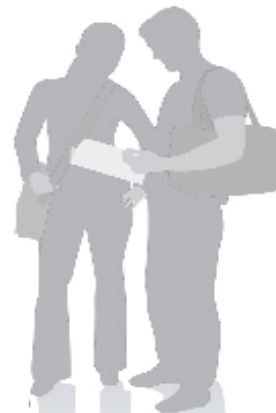
Image Requirements: All images provided for ads should be final, color corrected, hi-resolution (300 dpi) CMYK files. TIFF or EPS file type recommended. Hi-res images should not be scaled more than 115% to maintain image quality.